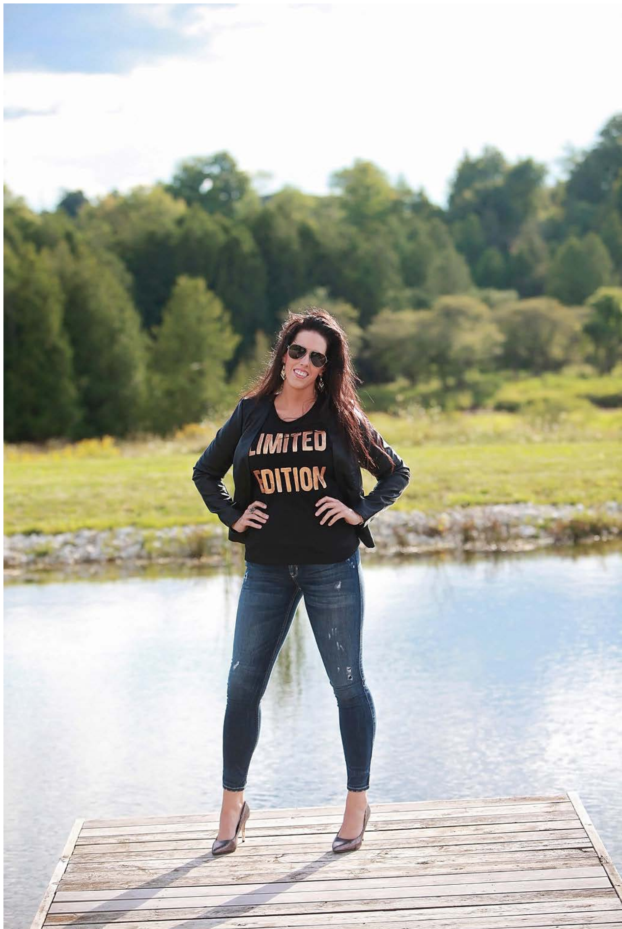
Love these distressed GUESS skinny jeans